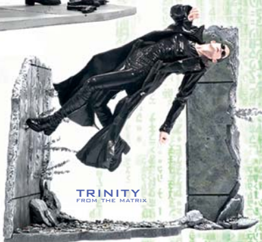
TRINITY FROM THE MATRIX