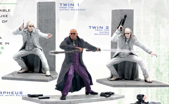
TWIN 1 FROM THE MATRIX RELOADED

ALSO AVAILABLE IS THE DELUXE BOXED SET OF NEO IN THE CHATEAU, BASED ON A FIGHT SCENE IN THE MATRIX RELOADED