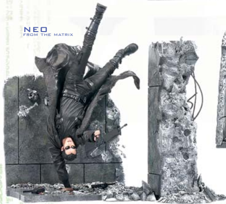
NEO FROM THE MATRIX